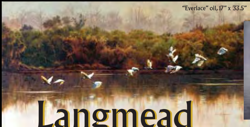
"Everlace" oil, 17" x 33.5"

patricia@patriciawalkerfineart.com www.patriciawalkerfineart.com (505) 466-3572