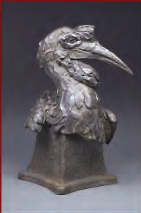
Halle Selassie 17" X 10" X 9" Bronze

Show: November/December of 2009 displaying 18 paintings