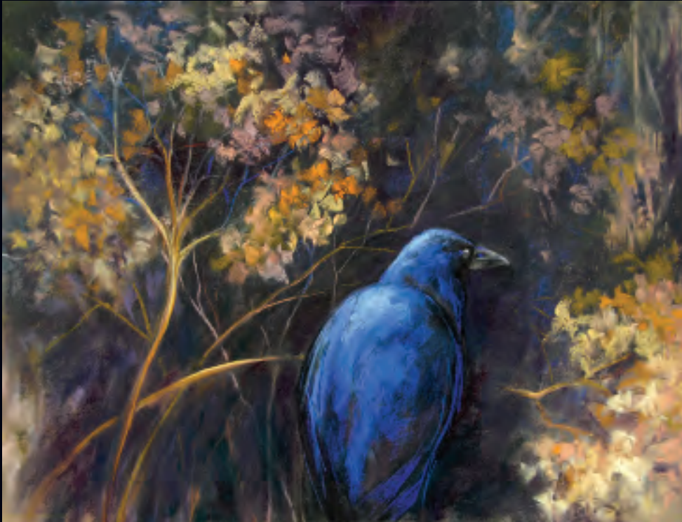
"Erwartung" Pastel 18 x 24"