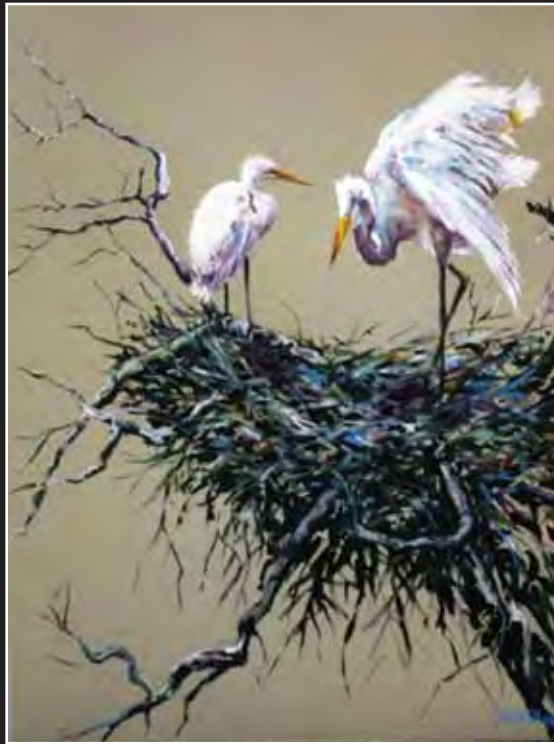
Nesting Egrets, watercolor, 24 x 18