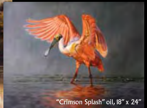
"Crimson Splash" oil, 18" x 24"