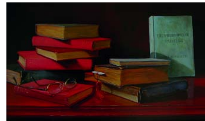
Robert C. Kirpatrick, The Philosophy of Painting oil on canvas 13 x 22"

● SOLD! A clever subscriber in Seattle snatched up this painting before the exhibition even opened from a gallery on the opposite side of the country.