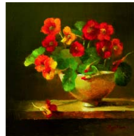
Olga Plam, Nasturtiums oil on canvas, 12 x 12"

● SOLD! These two paintings sold directly off the page to two of our subscribers after the gallery ran an advertisement in the December issue of American Art Collector .