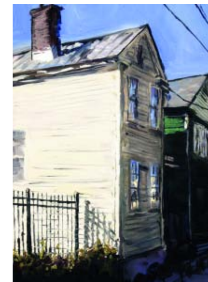
Charleston, Singles , oil on panel, 12 x 9"