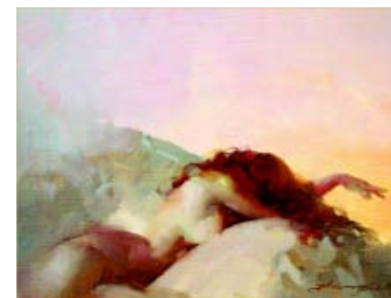
Zhaoming Wu, Figure as Landscape 12 x 16"